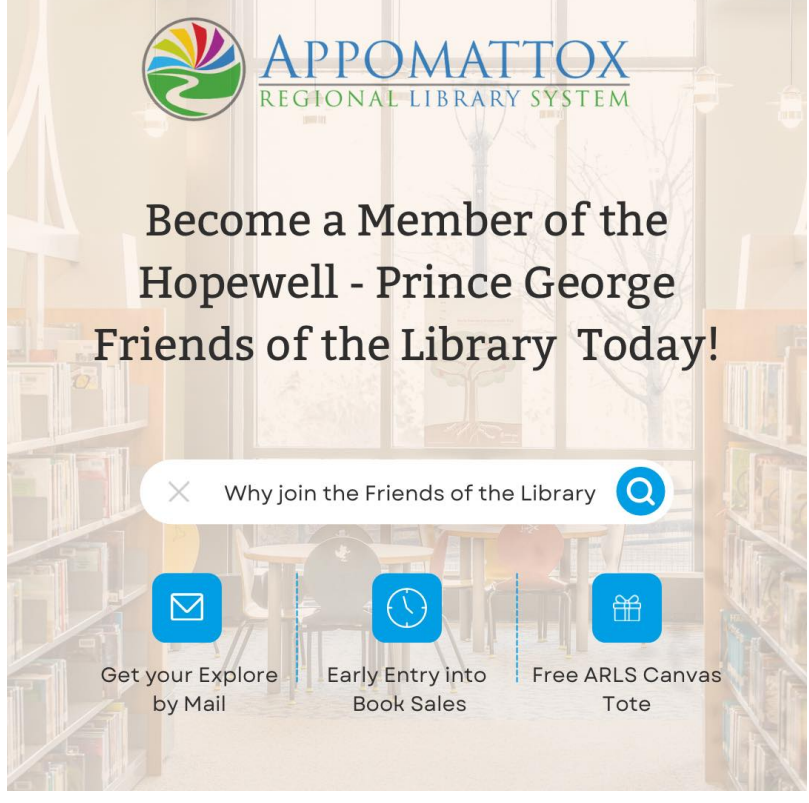
All new FOL members receive a library branded tote bag to show your support around town.